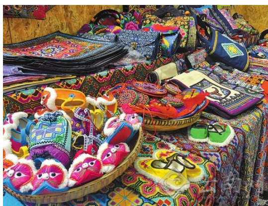
Figure 1 Yunnan folk arts and crafts industry at the time

At present, the disjointed teaching of folk art in local colleges and universities in Yunnan and the lack of inheritance and protection of local folk art resources lead to little understanding of local folk art resources in Yunnan or not enough understanding of traditional folk art. Yunnan local folk art has rich cultural background, which directly reflects the local thoughts and feelings of Yunnan and its aesthetic hobbies. Therefore, students of Yunnan local colleges and universities need to understand the most representative art forms of Yunnan national folk art, deeply explore the relationship between folk art and artistic design creation and understand the artistic characteristics of folk art. Through the study of local folk art and culture, we can develop the artistic potential of art students, improve their enthusiasm for learning regional culture and art, and expand the art teaching space of local colleges and universities in Yunnan, continuously develop and utilize innovative folk art resources, and promote the development of national folk art forms to realize the long-term sustainable development of culture and art.