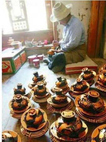
Figure 3 A Preliminary study on the Relationship between Yunnan folk technology and modern industrial design

elective courses. The teaching of pop art theory can be fully explained to students through compulsory public lectures and courses, so that students can have a deeper understanding of the excellent folk art culture of the Chinese nation and the local art culture, and allow students to combine local folk art resources with the creation of modern art design. The spiritual elements of folk art are incorporated into the design creation to produce works of art with local culture. Gradually forming art teaching with the spirit of the times and the characteristics of local universities, so that local folk art resources can continue to inherit, innovate and develop sustainably through local university education.